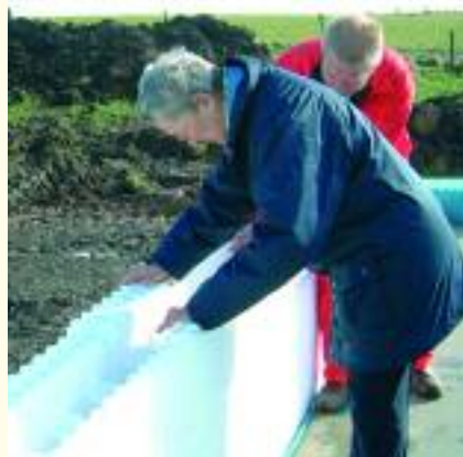
With a little local assistance