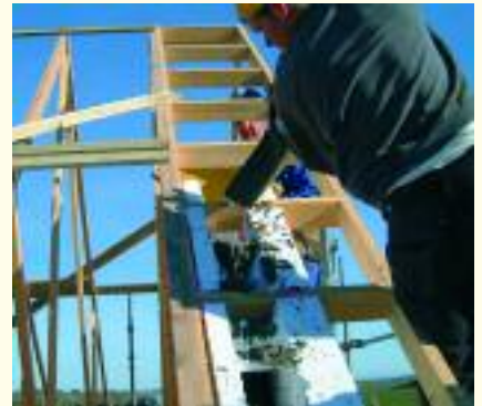
Building at eaves level

The robust nature of the materials used and the practicality of the building method suit the island environment very well and have