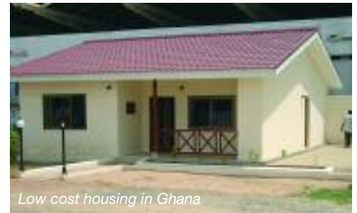
Low cost housing in Ghana