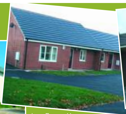
Low Energy Homes