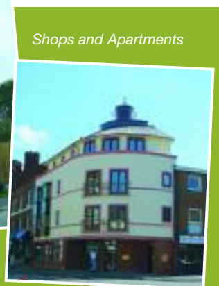
Shops and Apartments

Performance Leader for General Construction