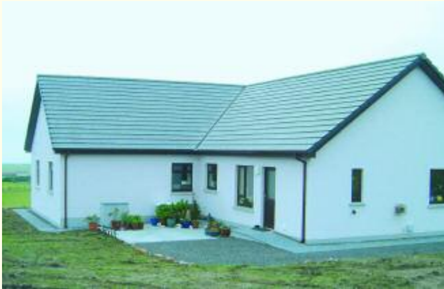
Completed WALLFORM home