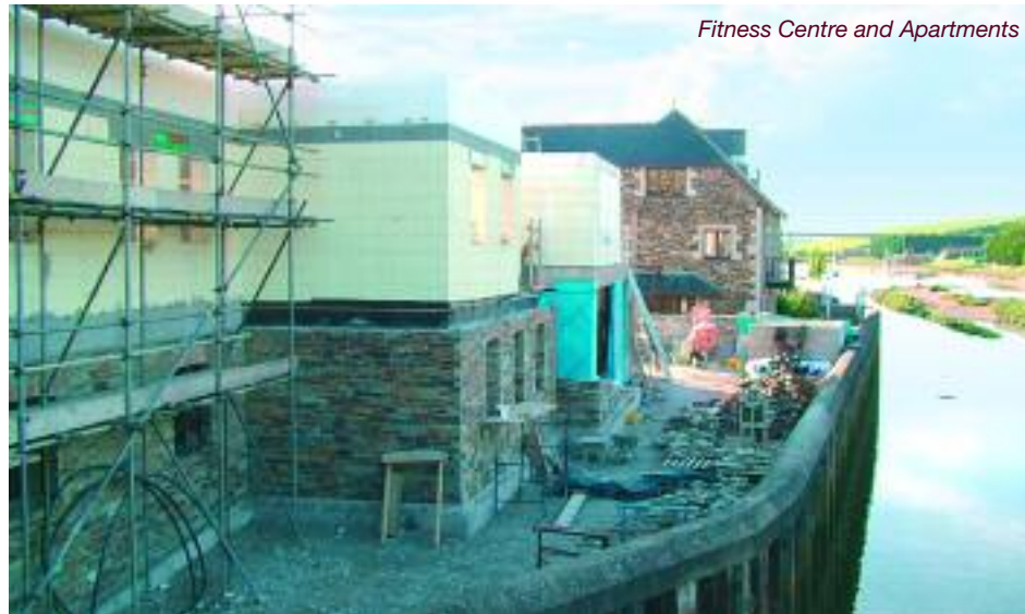
Fitness Centre and Apartments

just in the materials' purchase price, it is in the broader package of performance, savings in construction costs and long life expectancy. This proven building system has a specification to suit almost any construction - low cost housing, schools, hospitals, commercial buildings or high quality homes.